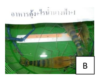
Figure 2. Giant Freshwater Prawn 4 month old at the end of the experiment. A) Giant Freshwater Prawn fed with commercial feed. B) Giant Freshwater Prawn fed with commercial feed and supplemented with Sirindhorn fairy shrimp.